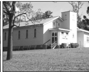
St John's 63 Prospect St