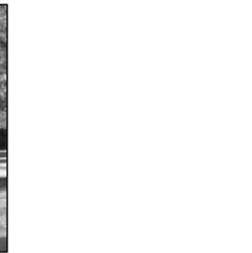
Minden 17 Edmond St