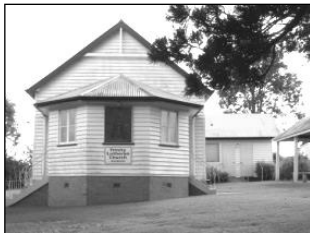
Trinity 593 Tallegalla Rd Lowood